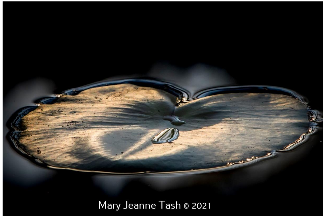
Mary Jeanne Tash © 2021

This is a most unusual “take” on a lily pad. The silver, black and gold tones and employing the concept of black water make for striking impact. The well-defined edges of the lily pad and the water provide dramatic tension.